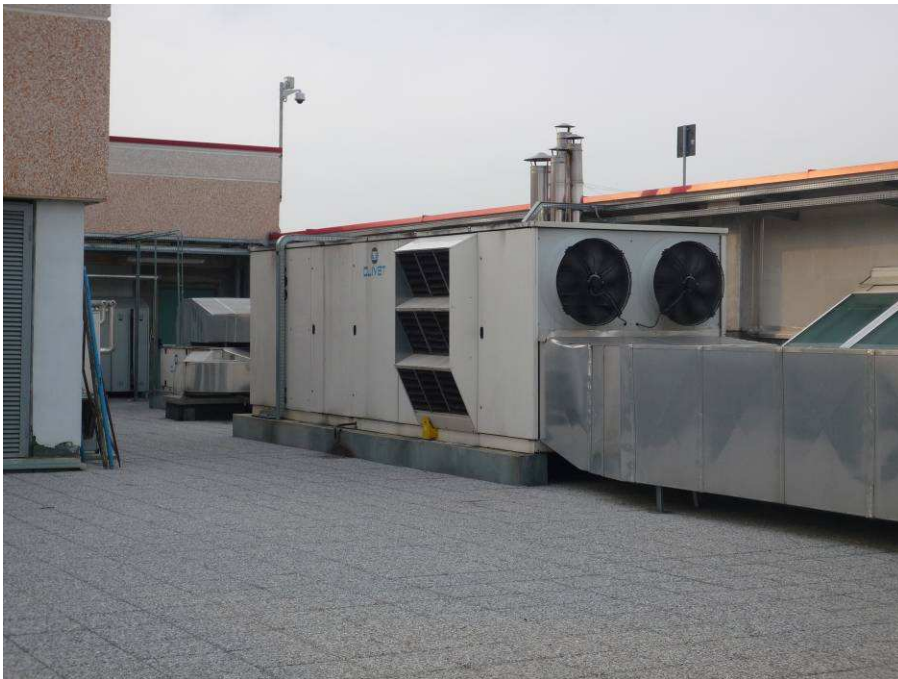
Roof-top serving supermarket zone