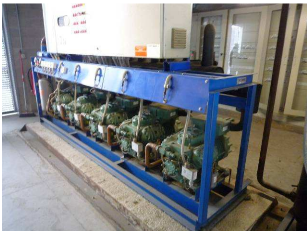
Alimentary refrigeration chiller

Due to the high cooling load needed for food refrigeration, a high amount of thermal energy has to be released to the condensers. The water loop system recovers this thermal input and deliver it to the units that are functioning in heating mode, e.g. those serving the supermarket zone. Operation of food refrigeration is critical, for this reason the condensers have two heat sink circuit in parallel, one to the water loop and one to air cooled heat exchangers. BMS open the connection between condensers and water loop when its temperature is between 10° and 30°C.