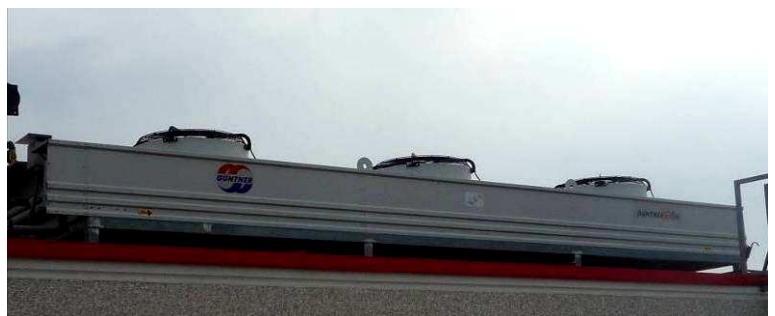
Air exchangers of alimentary refrigerators condensing circuit