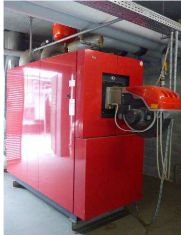
Gas condensing Boiler

In the conventional "base case", hot water is produced with two gas-fired boilers, while chilled water is produced with two electrical water chillers with screw compressors. The hot / cold water is distributed to the AHUs of the all-air system and to the dedicated units of the shops, which may be either roof-top units or small ducted units depending on size and location. In the "optimized case", a water loop HP system is present. Heat input to the water loop is provided by heat recovered from the food refrigeration equipment condensers, or by a backup gas fired boiler; heat rejection from the water loop is achieved with evaporative cooling towers. The water loop is connected to 62 distributed HP units, which again may be either AHUs with DX decks, roof-top units, or small ducted units (depending on size and location).