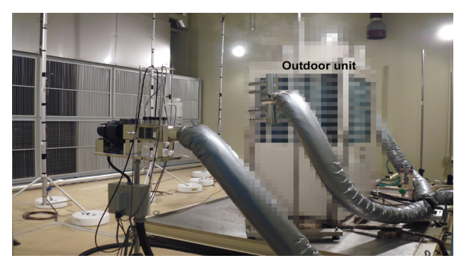
Outdoor unit of a variable refrigerant system during the load-based test without fixing compressor speed

Heat pumps are regarded as a very promising form of energy efficient heat generator. However, publicly available information on the actual characteristics of heat pump systems in buildings is still insufficient to meet the needs of both system designers and product manufacturing engineers. There may be great potential to improve design practices and accuracy of energy calculation methods, which can be applied to strengthen building energy codes and regulations.